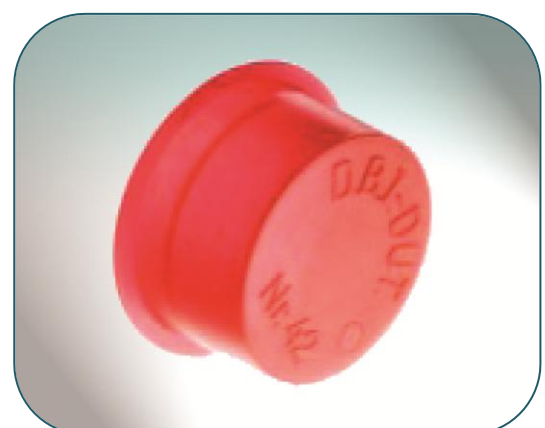
Figure 2: Tapered Pipe Cap