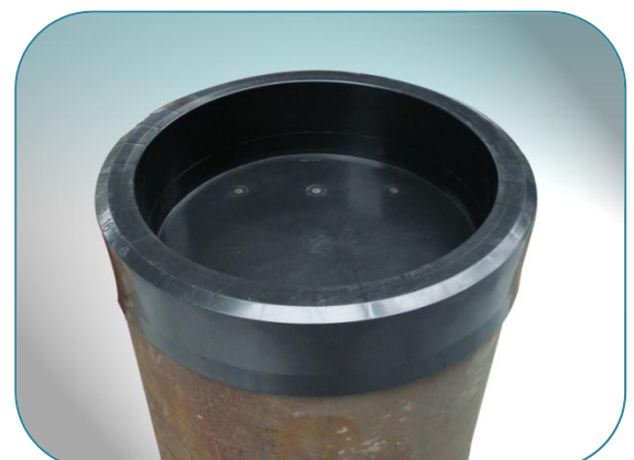
Fig 2: Pipe with Recessed Cap