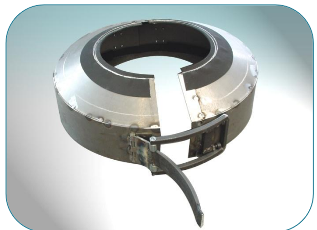
Fig 2: Masking Ring